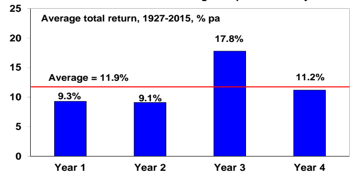
US sharemarket returns through the presidential cycle

Firstly, some facts. The election year, or Year 4, in the 4 year presidential cycle is normally an okay year for US shares with an average total return for such years since 1927 of 11.2%.